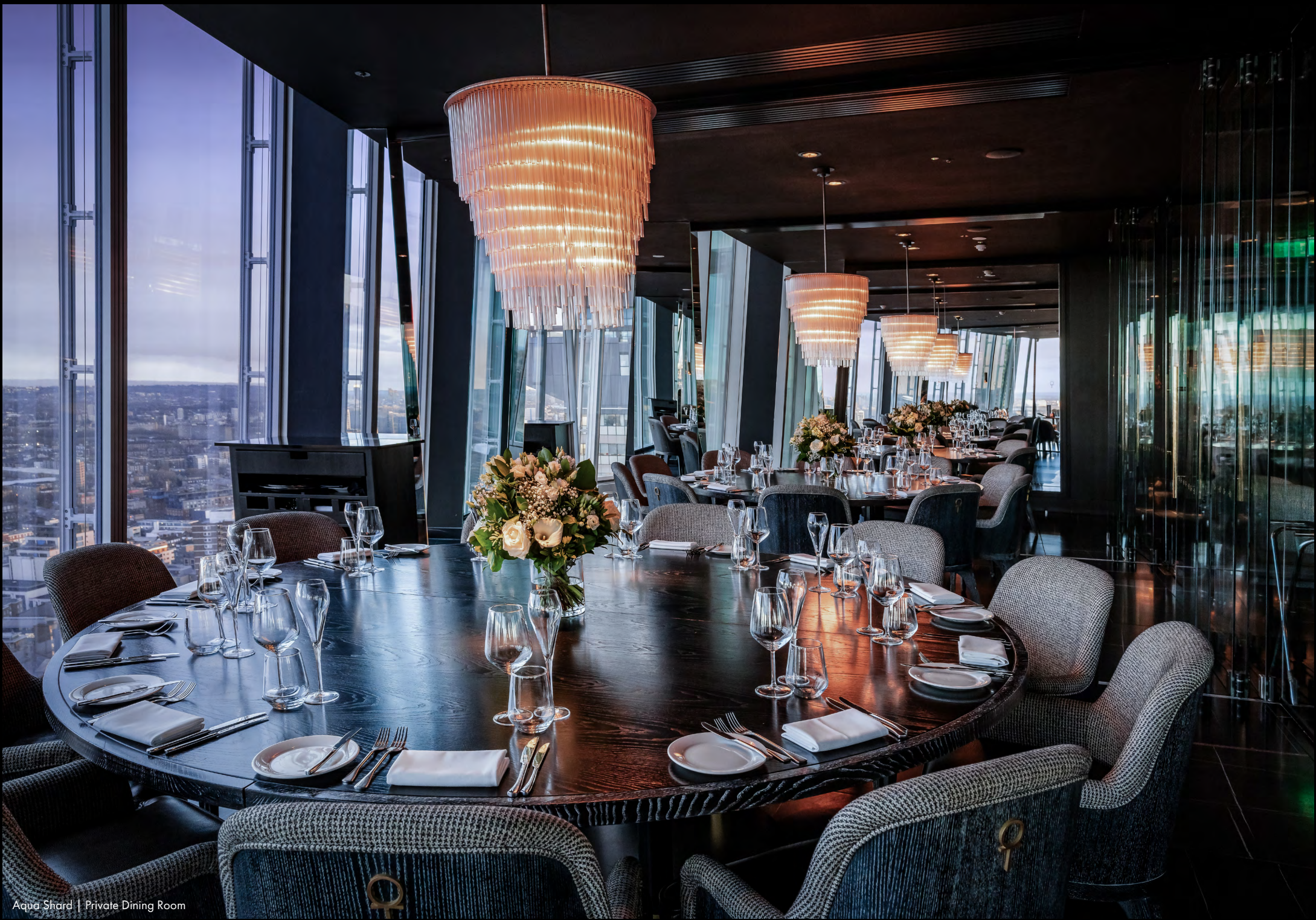
Aqua Shard | Private Dining Room