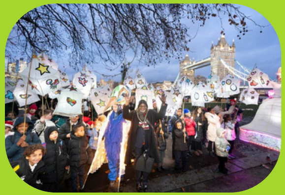
PC Lee on celebrity close protection duty as children light up the Lantern Parade