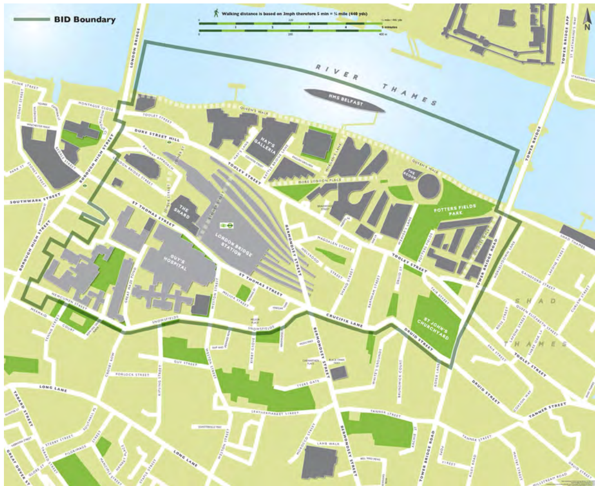
Figure 1: Team London Bridge BID area